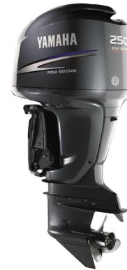
F250TXR / LF250TXR